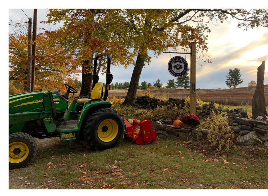
Mechanical Harvester (2019 Award) Burnt Hill Blueberry Farm